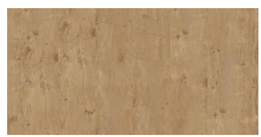
LVT Click flooring

The following figure shows an example of LVT Click flooring: